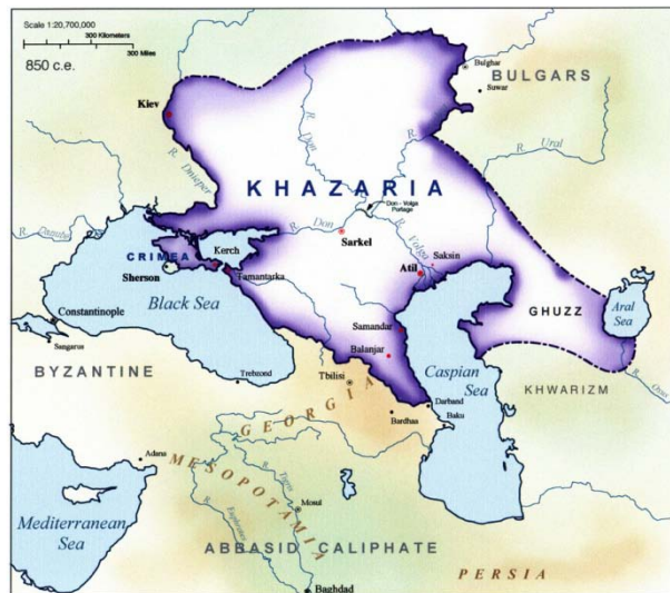
The Khazarian Empire at the height of its power.

King Bulan and his four thousand feudal nobles were promptly converted by rabbis imported from Babylonia for the event. Phallic worship and all other forms of idol worship were there after forbidden. The Khazarian Kings invited large numbers of Rabbis from Babylon and vicinity, to come and open synagogues and schools to