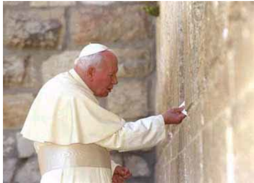
John Paul II, inserting a prayer slip into the Wailing Wall, Jerusalem.

Pope John Paul II arrived in Israel March 21, 2000, for a historic five-day visit, during which he visited the holy sites of the three major religions and met with Israel's political leaders and Chief Rabbis. Though ostensibly a trip focused on religion, the Pope also touched on political issues, blessing Israel, expressing support for a Palestinian homeland and apologizing for sins committed by Christians against Jews.