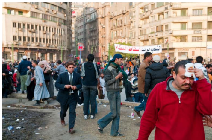
Some Muslims believe fighting in the Middle East prepares the way for the arrival of the Mahdi.

Other Muslims believe that as soon as they are in complete control of Jerusalem, then the Mahdi will be occulted (appear) and lead them to conquer the rest of the world for Islam.