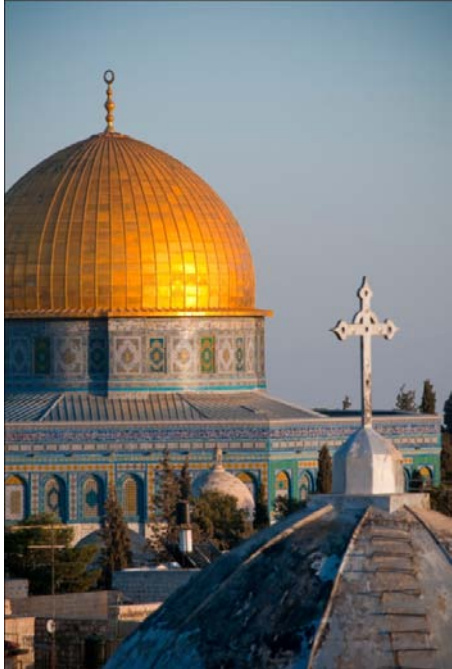
Jerusalem is central to the apocalyptic expectations of the world's three largest religions.

While the ongoing acts of violence committed by Palestinians against Israelis frequently make the news headlines, the many instances of innocent Palestinians, American civilians and many others baited and antagonized by Israeli troops, and even killed outright, rarely if ever make the news. Yet such atrocities by Israelis against the Palestinians and others are an on-going reality. Careful research by many different scholars has exposed the Zionist agenda behind innumerable wars, including collusion with the Nazis during World War II.